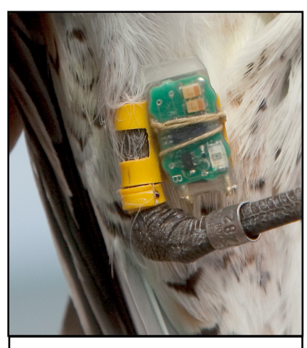
Researchers demonstrated that the lightweight geolocators, seen here in detail, did not affect the Red Knots' behavior or survival rates.

These results suggest that geolocators are likely to afford valuable new insights to our understanding of Red Knot migration strategies, as well as their breeding and wintering locations. Between May 2009 and May 2010, the research team fitted geolocators to 200 more Red Knots they caught in Canada, Massachusetts, New Jersey, Florida, Texas, and Argentina. The future recovery of some of these birds and their geolocator data will add even more knowledge to aid Red Knot conservation.